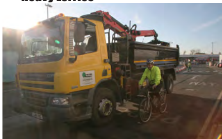
A demonstration of the lorry warning system.

At the end of November the council launched a trial of new lorry safety technology. The Cycle Safety Shield System detects cyclists and pedestrians 360 degrees around the vehicle, while filtering out inanimate objects such as traffic bollards and lampposts. The position of cyclists can be displayed on a monitor in the cab, and an alarm sounds if a cyclist or pedestrian comes too close to the vehicle. The council has fitted the system to a highway repairs lorry, and will test it over a six month period.