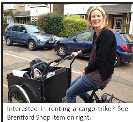
Interested in renting a cargo trike? See Brentford Shop item on right.